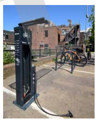
Baker Lane Active Travel Hub