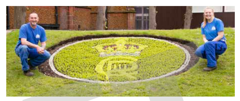
Coronation Badge Flowerbed, Tower Gardens