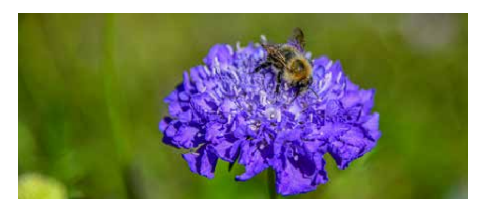
Wildflower and Pollinator Opportunities