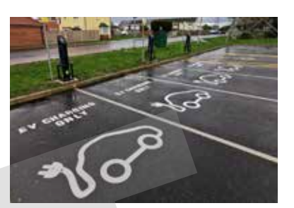
EV Chargers, Lynnsport