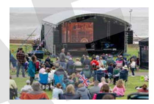
Community Event, Hunstanton