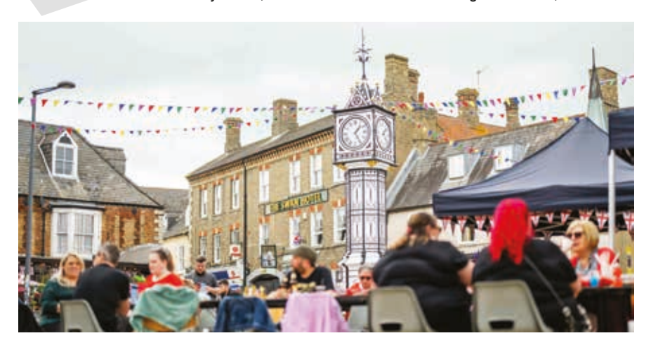
Community Event, Downham Market