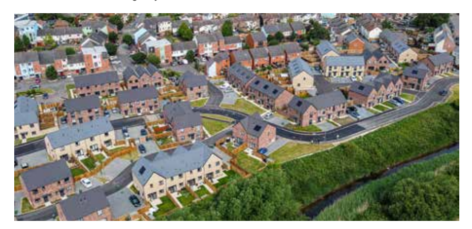
Nar Ouse Development, King's Lynn